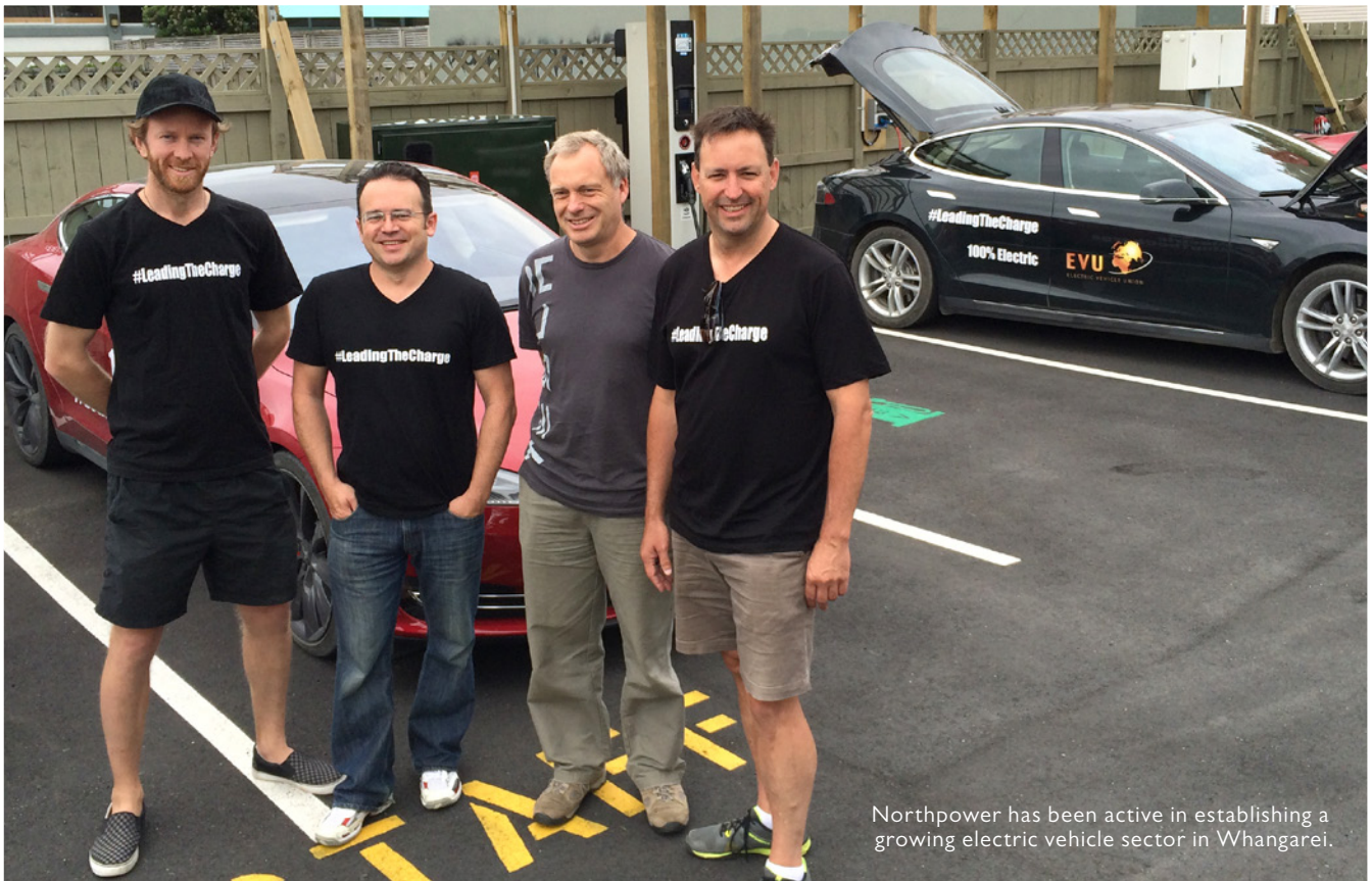
Northpower has been active in establishing a growing electric vehicle sector in Whangarei.