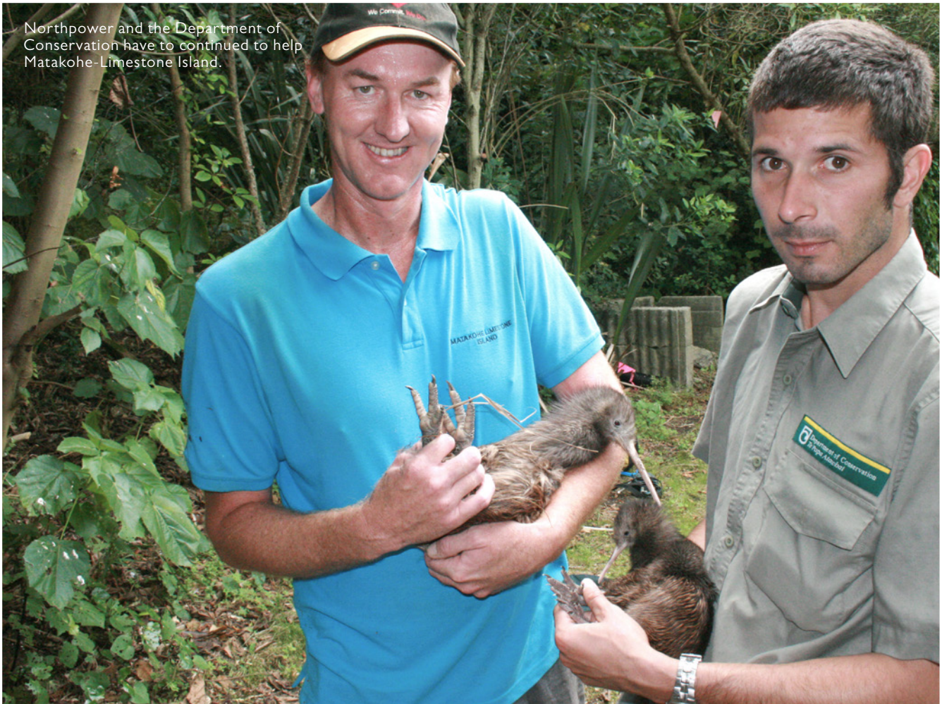
Northpower and the Department of Conservation have continued to help Matakohē-Limestone Island.