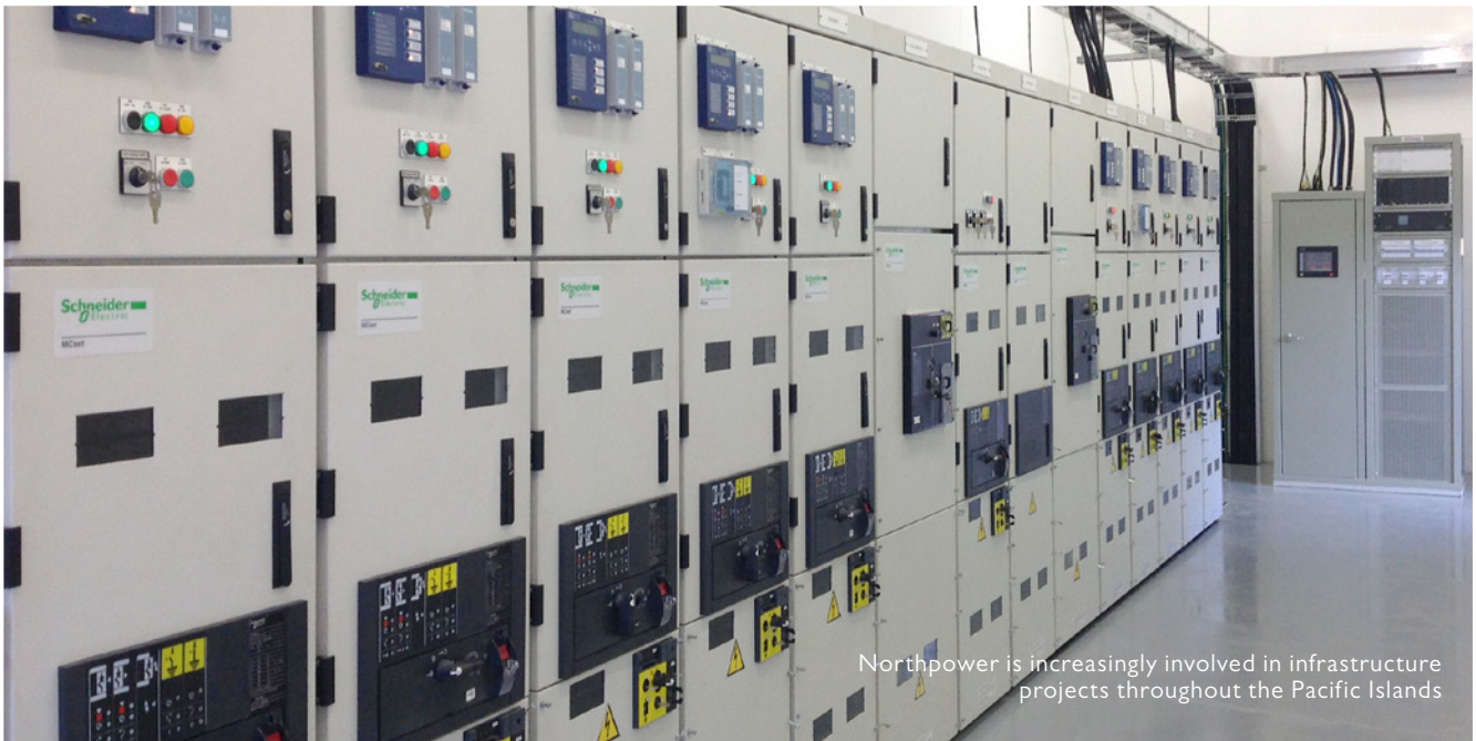
Northpower is increasingly involved in infrastructure projects throughout the Pacific Islands