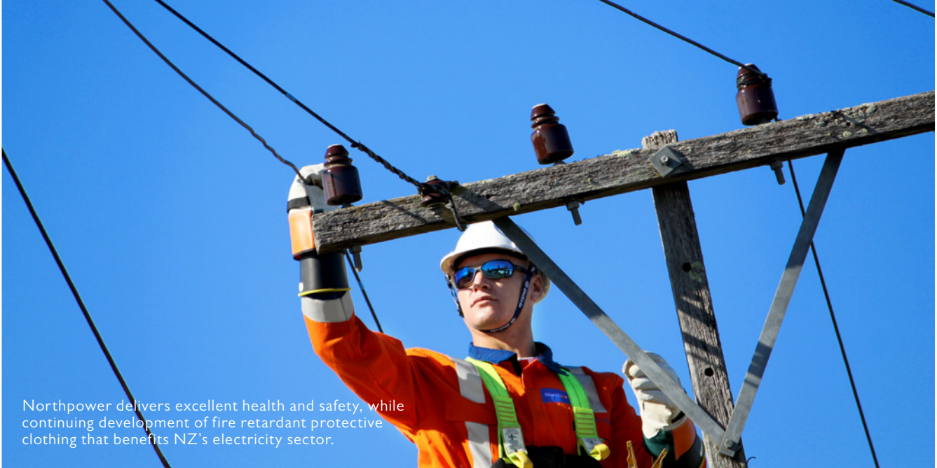
Northpower delivers excellent health and safety, while continuing development of fire retardant protective clothing that benefits NZ's electricity sector.

Safety – is strategic priority and underpins everything we do – to keep our staff, the public and our clients safe. Northpower has built a reputation over many years for taking an industry lead on safety. We do this in open collaboration with others and through our own safety leadership. Northpower remains committed to Zero Harm.