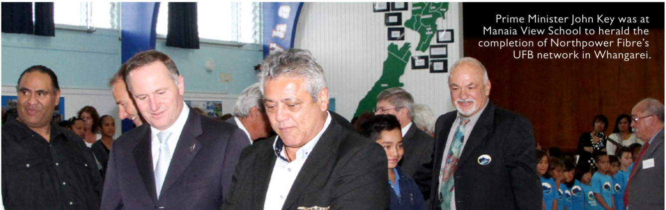
Prime Minister John Key was at Manaia View School to herald the completion of Northpower Fibre's UFB network in Whangarei.