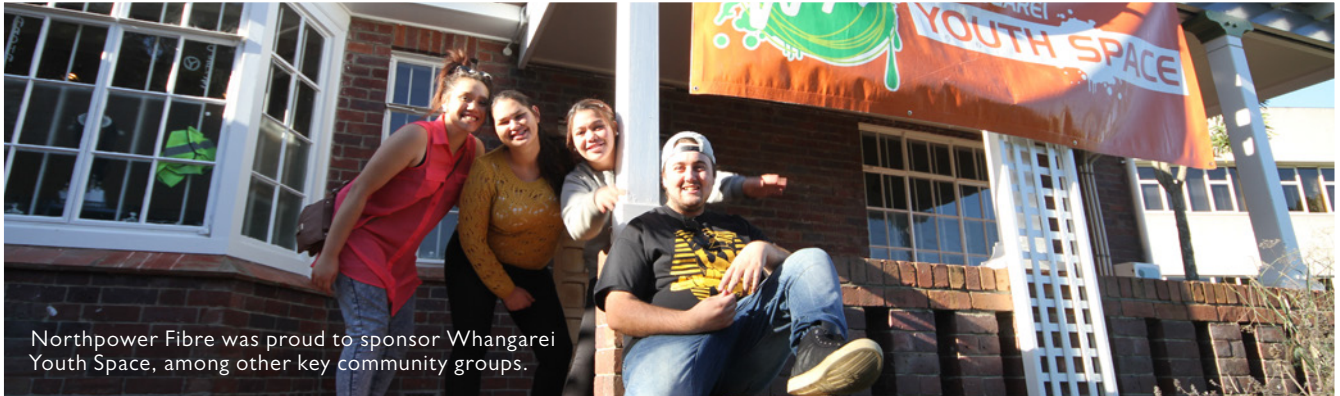
Northpower Fibre was proud to sponsor Whangarei Youth Space, among other key community groups.

Community – Through our consumer-owned Trust model, Northpower has a responsibility to operate a business model that enables our Trust to be able to fairly and evenly give back the profits of the business to the shareholders of Northpower – those people in Kaipara and Whangarei connected to the Northpower electricity lines network.