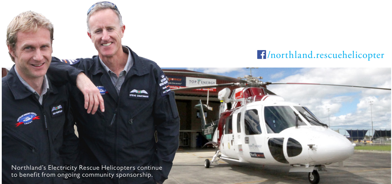
Northland's Electricity Rescue Helicopters continue to benefit from ongoing community sponsorship.