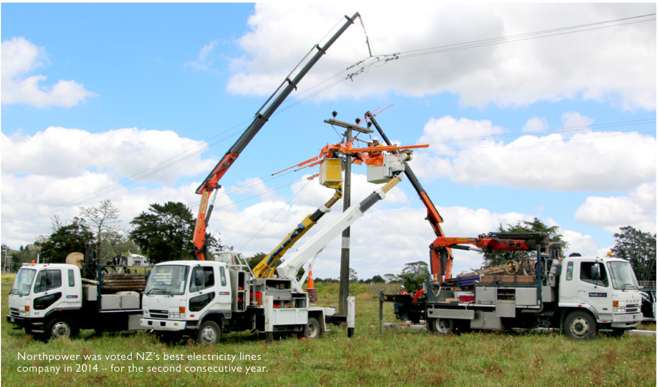
Northpower was voted NZ's best electricity lines company in 2014 – for the second consecutive year.