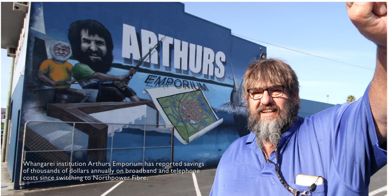
Whangarei institution Arthur's Emporium has reported savings of thousands of dollars annually on broadband and telephone costs since switching to Northpower Fibre.