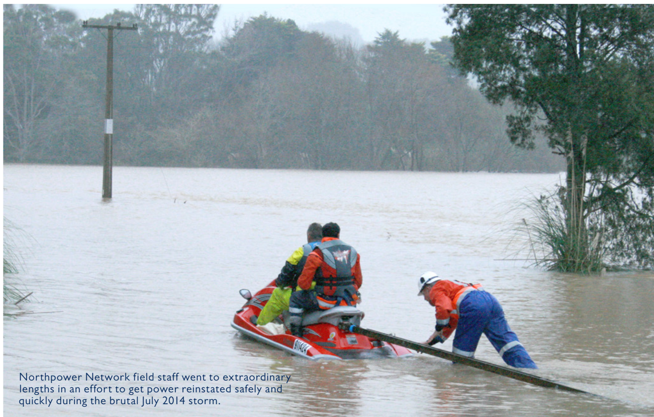
Northpower Network field staff went to extraordinary lengths in an effort to get power reinstated safely and quickly during the brutal July 2014 storm.

Network – Northpower’s foundation is its electricity network in Kaipara and Whangarei. More than 55,000 consumers connected to our growing electricity network are the beneficiaries of years of careful planning and growth to establish a solid business and reliable electricity network for current and future generations.